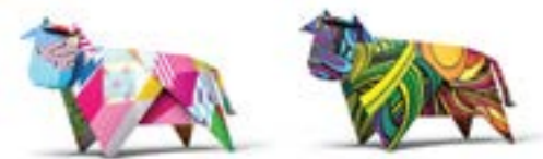
HP SmartStream Mosaic one-of-a-kind designs.